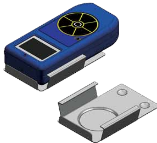
Wipe Test Plate