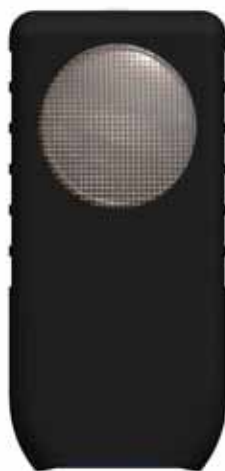
View of Back