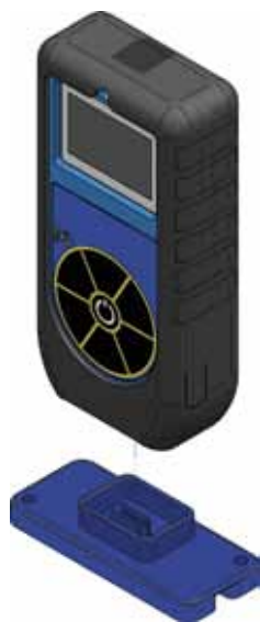
Ruggedized boot and Stand Included